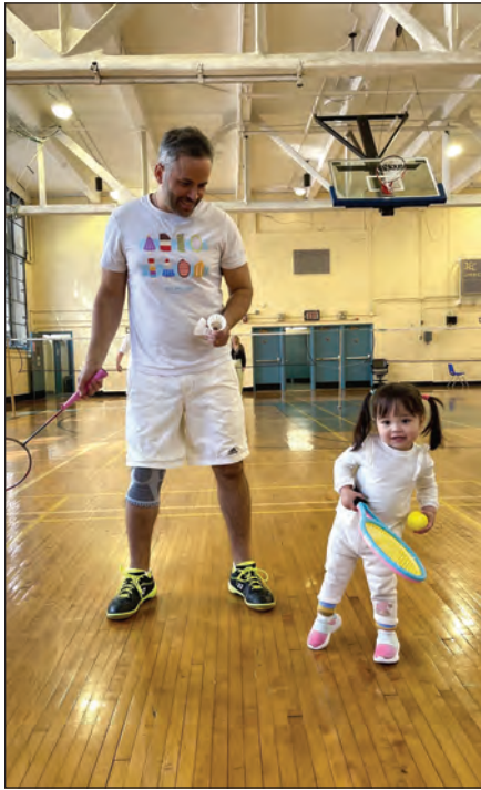
Above: From novice players still learning one end of the shuttlecock from the other, to former professional athletes, and every level of ability in between, the BCCNY's members share an enthusiasm for the game and a delight in being able to play.

part of their club's traditions, but today, members also regularly socialize after their Saturday matches at a nearby gastropub. The club's social origins remain at the heart of the club. An elegant cocktail party welcomes the start of the badminton season, and an annual luncheon, an end-of-season party, and summertime events are just part of the BCCNY's social calendar. Round robin games and championship tournaments liven up New York's cold early spring days, and once a year, BCCNY members unite with members of the Larchmont Badminton Club for a day of social play.